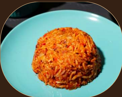
JOLL OF RICE